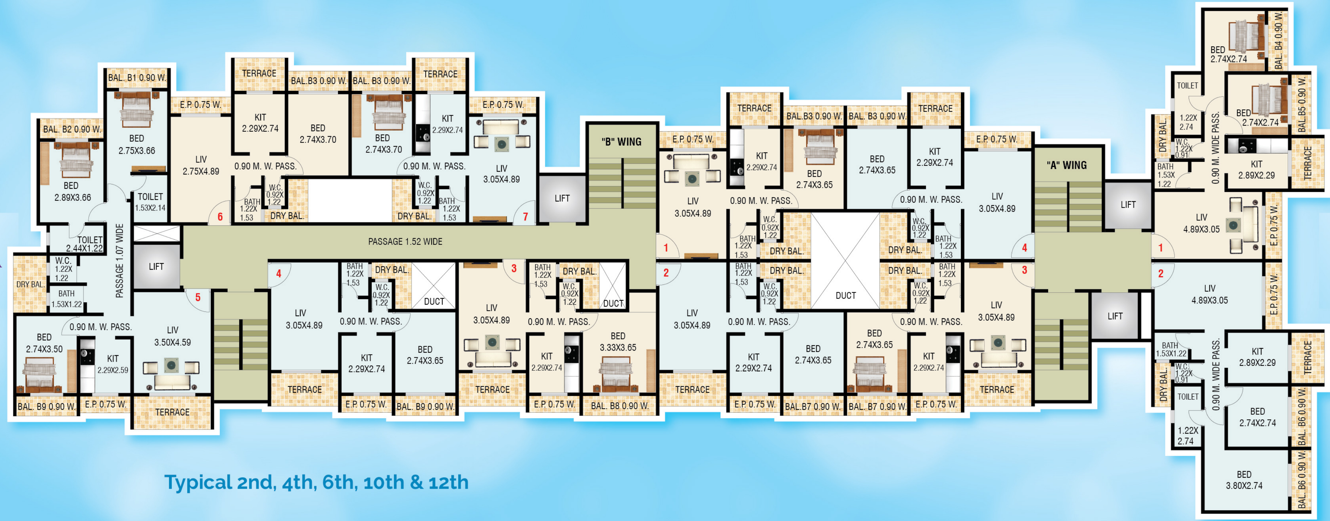
Typical 2nd, 4th, 6th, 10th & 12th